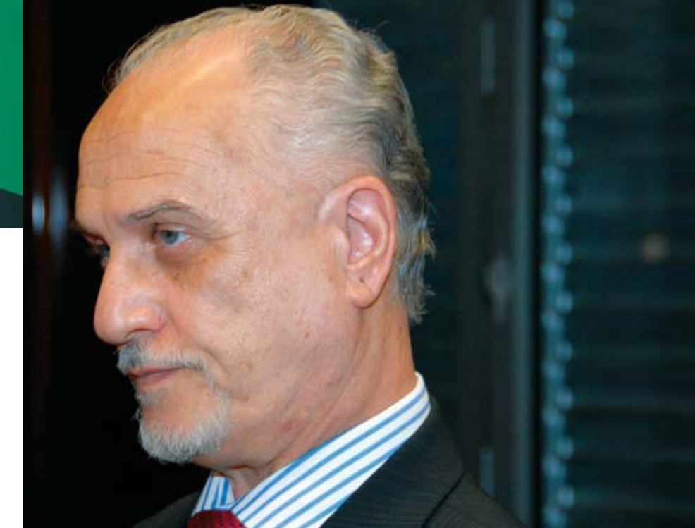
Dr Hussain Al-Shahristani, Iraqi Oil Minister.

ajor international oil companies made the trip to Baghdad in December 2008 to attend the country's first significant oil and gas exhibition. The Iraq Energy Expo and Conference, organized by the Iraqi American Chamber of Commerce and Industry, in cooperation with the Iraqi Oil Ministry, drew large crowds and aimed to attract companies to invest in one of the world's largest oil reserves.